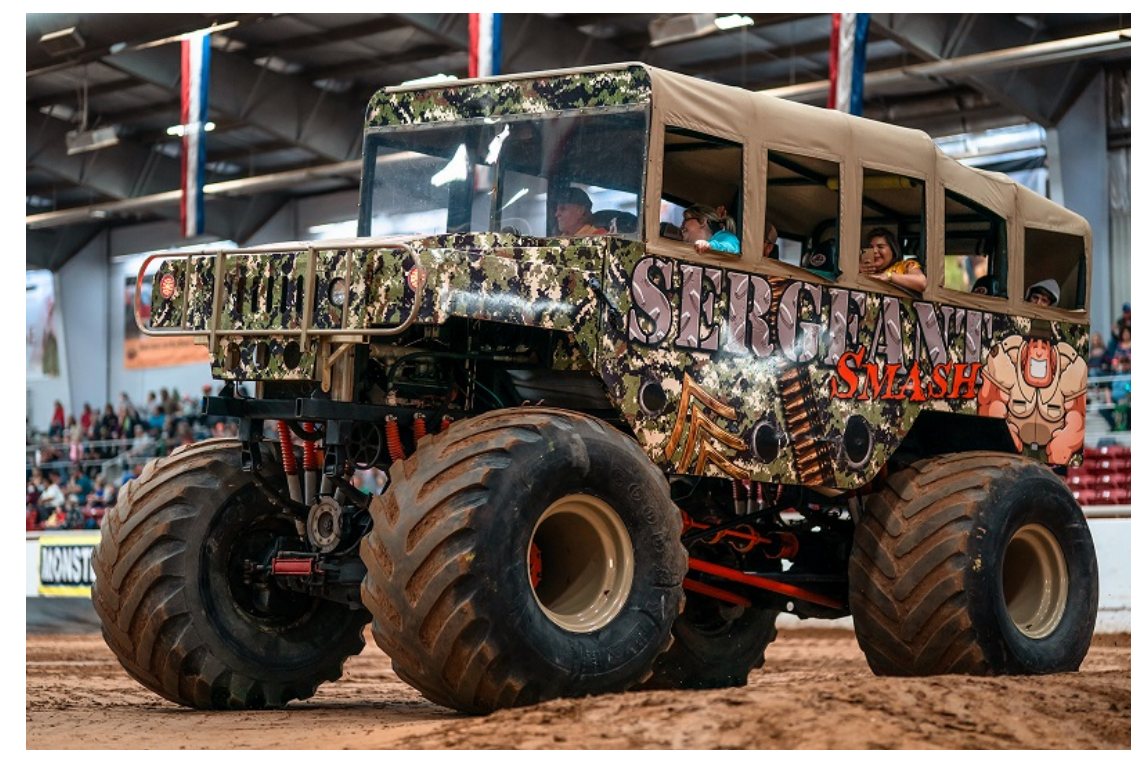
FREE rides before and after the show at 6:30pm for Fairgoers in the Sergeant Smash Monster Truck!

"We are excited to introduce our first Monster Truck show at the Wilson County – Tennessee State Fair! We are bringing in talent